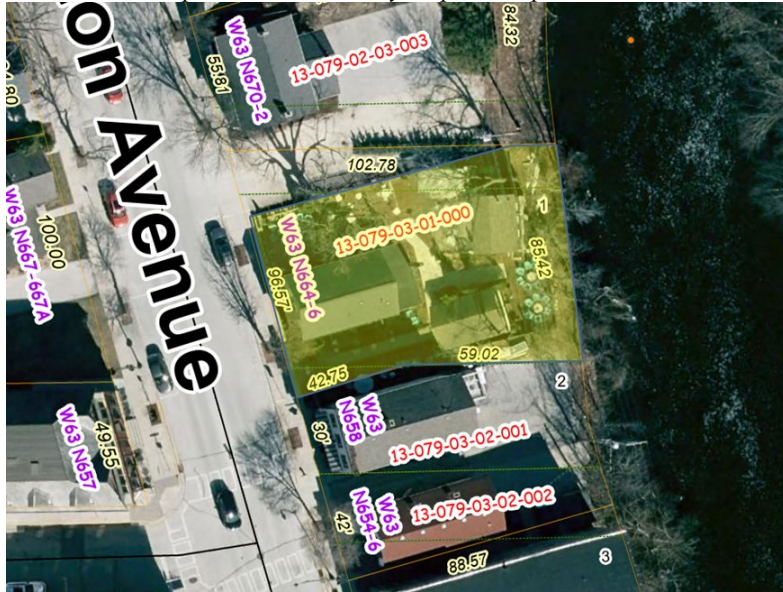
Outdoor consumption area boundary map – Camp Bar

Note that the above area is different than the full property boundary (see map below).